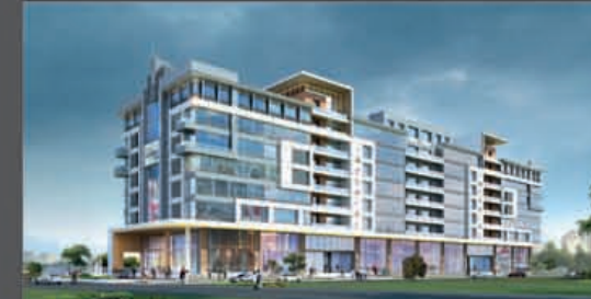
IMPERIAL TOWERS @ AMEERPET