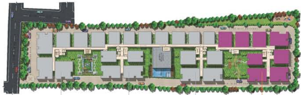
BLOCK-A BLOCK-B BLOCK-C BLOCK-D