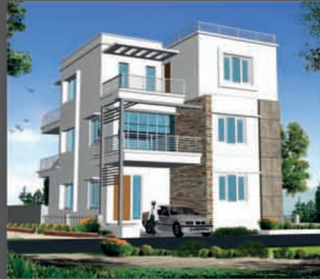
VASAVI'S NAKSHATRA - J' HILLS