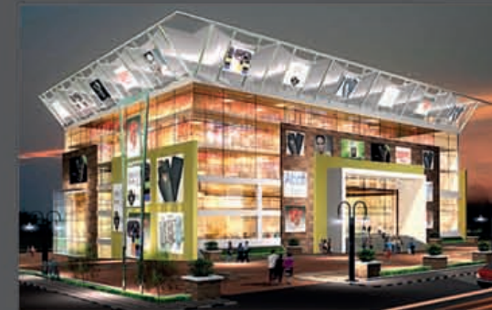
SVR CAPITOL @ KUKATPALLY