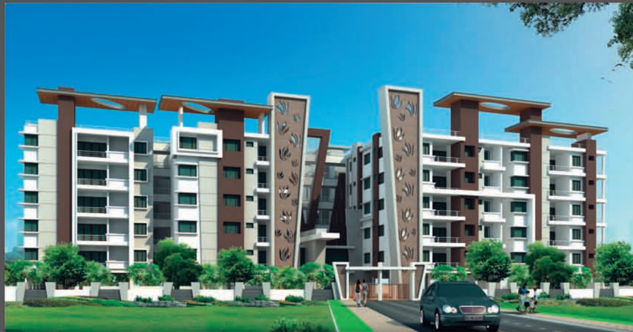
VASAVI'S BHUVANA @ SRI NAGAR COLONY