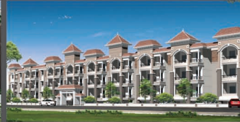
SRI GAYATRI ELEGANT_KARKHANA, VIKRAMPUR, SECUNDERBAD