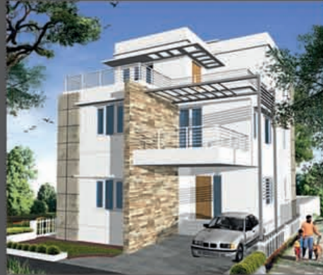
LUXURA GREENS @ BOWENPALLY