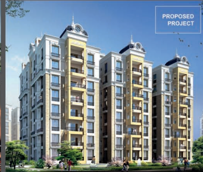
BRINDAVANAM - APARTMENTS @ MOTI NAGAR