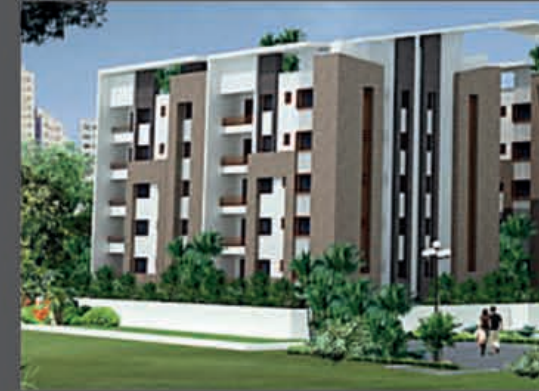
VASAVI'S GRANDE VISTA - THIRUMALAGIRI