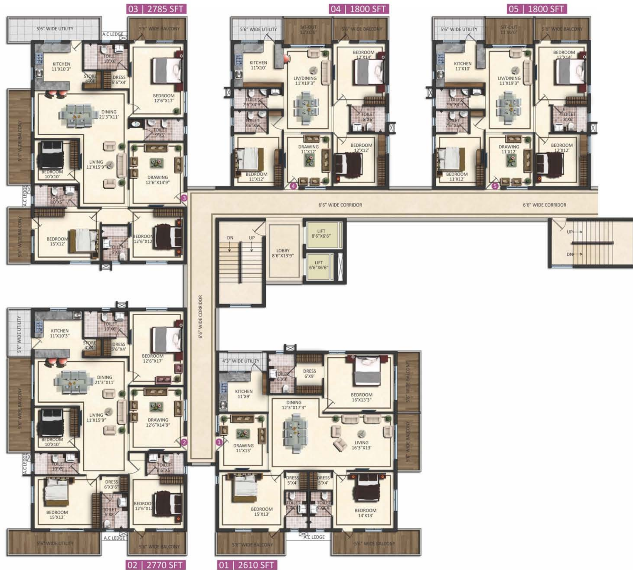
Typical Floor Block-A